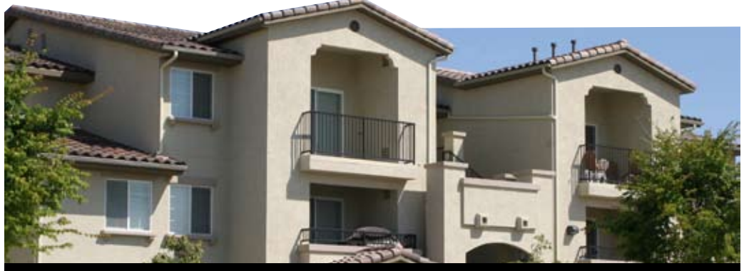
Fairbanks Ridge, San Diego, CA, Chelsea Investment Corporation.

Complete acknowledgements may be found in the working paper draft, available online at www.nhc.org/housing/iz or http://furmancenter.nyu.edu/publications/index.html. All opinions, errors or omissions, however, are those of the Furman Center alone.