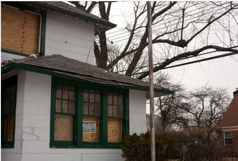
A house in Southeast Queens, epicenter of the foreclosure crisis in New York City.