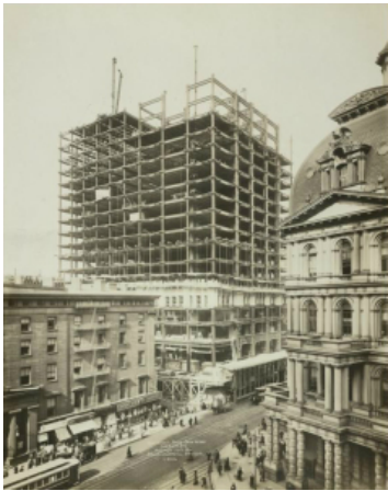
Construction is up, but it's no 1912.

Twitter 10 Facebook 4 Reddit Google +1 Email Print