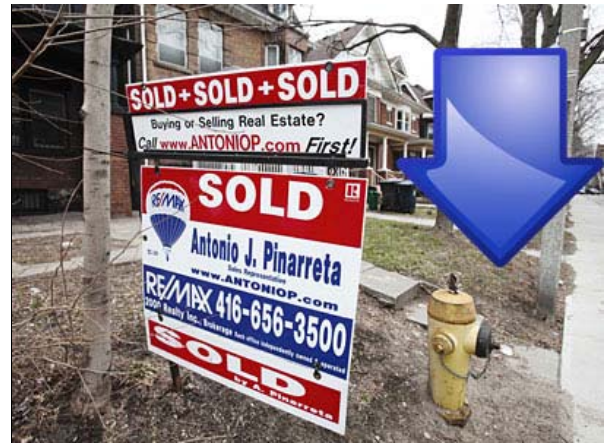
Home sales are down

Tags: "foreclosures" , furman center , sales volume