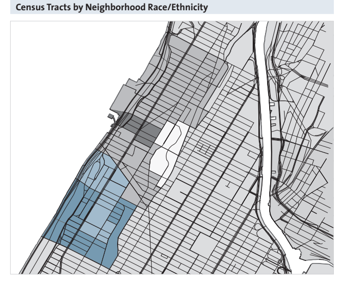
Majority White Majority Hispanic Integrated Mixed-Minority

About 53 percent of the population in MN 09 live in a mixed-minority neighborhood, compared to 22 percent who live in majority white neighborhoods and six percent who live in majority Hispanic neighborhoods. The rest of the population live in integrated neighborhoods.