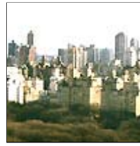
The Most: Upper East Side

Community groups use this data to address issues in their communities, such as so-called predatory lending -- housing loans with excessively high interest rates or fraudulent terms. Groups working to address housing code enforcement - a key fight for many housing activists this year -- have also used it. (See related story, Housing Activists' Fall Agenda .)