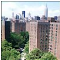
Highest: Stuyvesant Town-Turtle Bay