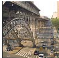
Cheapest: Central Harlem

A general rule of thumb is that people should spend about 30 percent of their income on housing and utilities. By this measure, the Furman Center calculates, a family making $32,000 should pay no more than $800 a month on housing. But between 2002 and 2005, the number of apartments that that family could afford decreased by 205,000 homes.