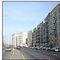
Lowest: Mott Haven/Hunts Point

As New Yorkers obsess about real estate - some struggling to find a place to live, others worried about staying off eviction, still others hoping to get rich off the market - they all think they know what is going on in the housing market: Housing is scarce and expensive. But the picture is complicated, playing out differently in different neighborhoods, and the effect of the situation varies from community to community, as do the reactions to it.