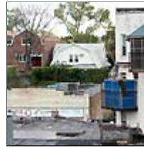
The Most: Borough Park