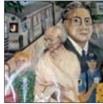
Most Diverse: Ozone Park-Woodhaven, Queens