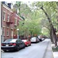
Most Expensive: Greenwich Village-Financial District