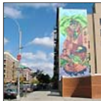
The Least: Washington Heights/Inwood

What housing there is in New York City -- houses and apartments, rentals as well as coops and condominiums -- continues to grow more costly.