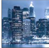
Lowest Rate: Financial District

New York City Census Fact Finder: The planning department's home page features a "GeoQuery" box. Typing in an address brings you to a map, showing the census tract and the adjoining area, and to tables with a lot of information from the 2000 census. Two pages focus on housing - one on characteristics, including vacancy rates, types of housing and so on; the other looks at costs.