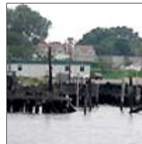
Highest: North Shore, Staten Island