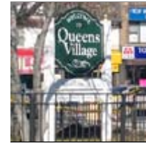
The Least: Queens Village