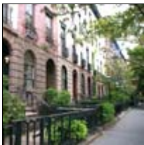
The Most: Clinton - Chelsea