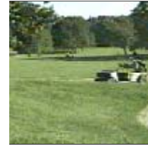
Least Diverse: South Shore, Staten Island