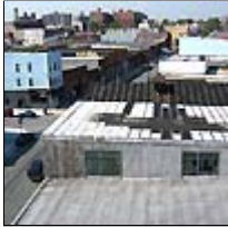
Highest Rate: Bushwick