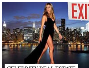
CELEBRITY REAL ESTATE

Jennifer Aniston Sells West Village Apts. for $6.5 Million